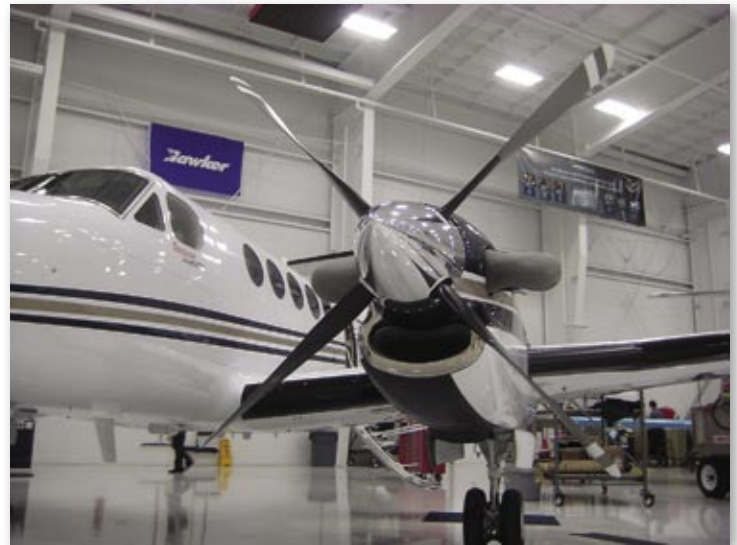
B200GT equipped with full EPIC PLATINUM, which includes Raisbeck Performance Props (featured)!

The added value, performance and utility of Raisbeck systems, along with the efforts of our dealers, is why we have had the third best year in our history despite the global economic troubles. Addition-