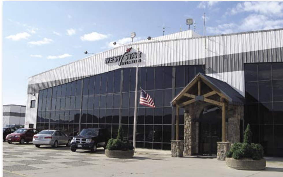
West Star Aviation's facility in Grand Junction, Colorado, has installed more ZR LITE systems and Aft Fuselage Lockers than any other Raisbeck Dealer.

Raisbeck Engineering has been in the business of helping companies keep their competitive advantage for over thirty years. Our ZR LITE Drag Reduction Systems provide the owners and operators of Learjets with greatly enhanced performance